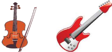
Violin, electric guitar, etc. String instruments