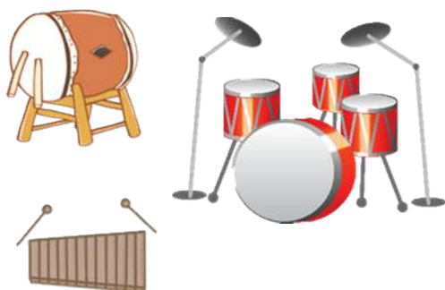
Taiko , xylophones, drums, etc.