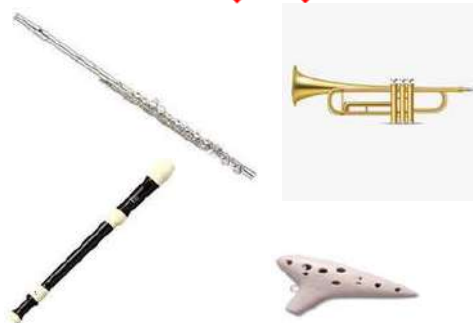
Woodwind, brass, flute, etc.