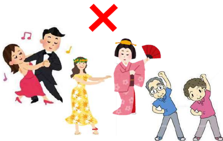
Dance, Japanese dance, gymnastics, etc.