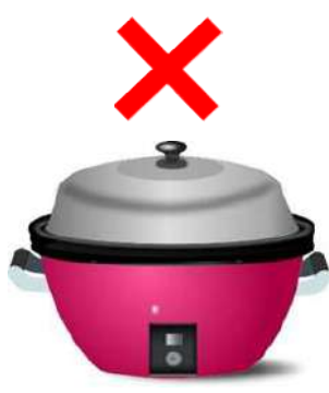
Rice Cooker, Warmer